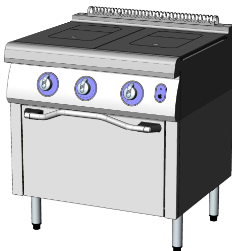
SOLID TOP B107PG8FG